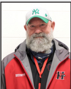
Bob Welch ES

The men walking the hallways and grounds of the Holley campuses are there to serve one purpose: to keep everyone safe. They are the security force at Holley, employed by C.O.P. Security. These four men are retired deputies and officers from local law enforcement agencies. They spend their days, evenings and weekends patrolling the Holley school properties inside and out, monitoring the security cameras and supervising the various events on campus. They enjoy working with the students and staff. The officers who keep our schools safe are: