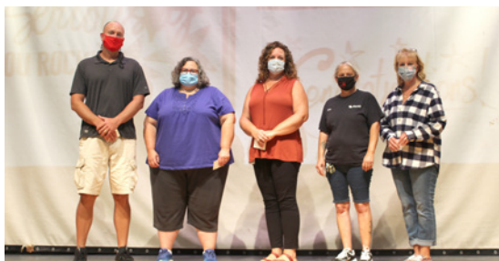
20 years of service