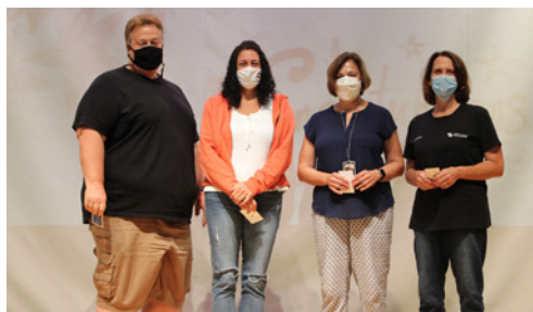
25 years of service