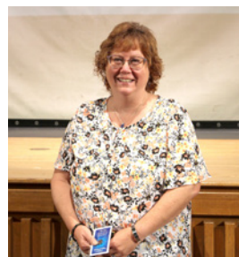
30 years of service