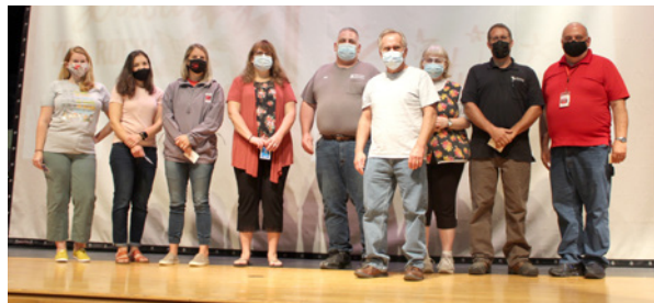
5 years of service