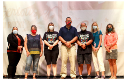
15 years of service