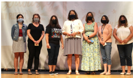
10 years of service